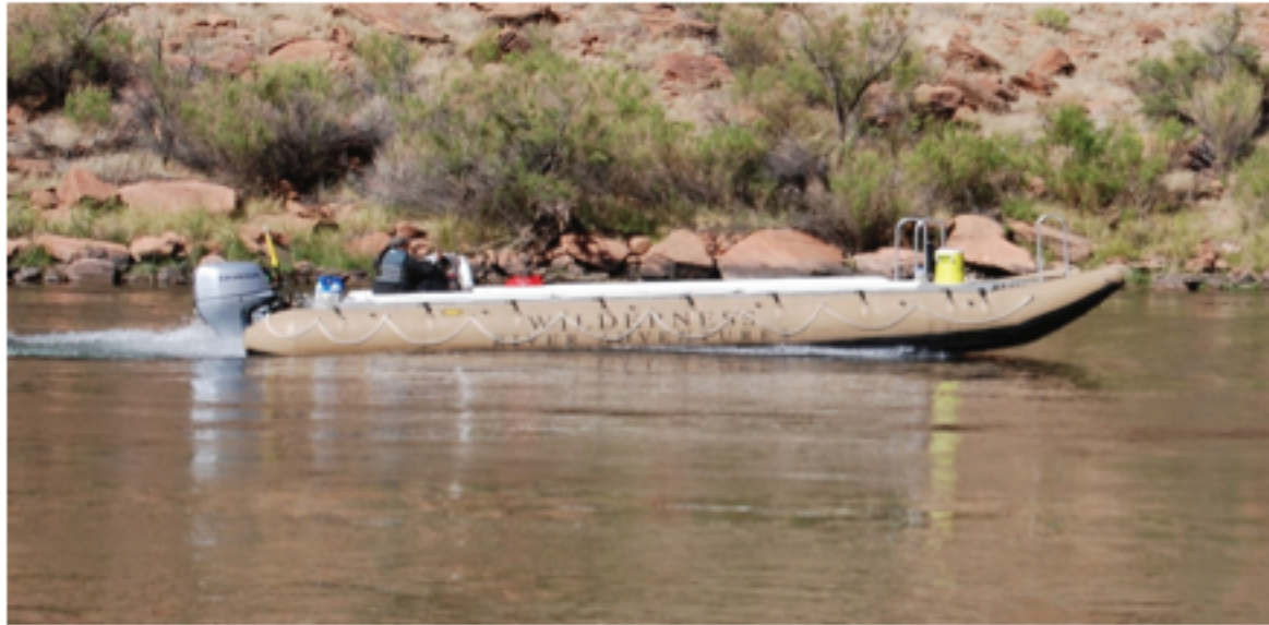
32' River Freighter - USCG stability letter for 32 passengers.

This price list includes examples of the many boats we build. As you may know, we build to customer specs. , so if you do not see the boat to fit your requirements, give us a call. The boats we build are utilized in many working environments including: