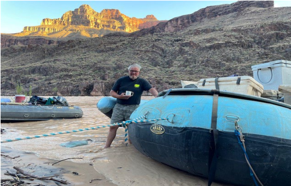
Grand Canyon trip August 2022 on the Colorado River in Arizona.

This price list includes examples of the many boats we build. As you may know, we build to customer specs. , so if you do not see the boat to fit your requirements, give us a call. The boats we build are utilized in many working environments including: